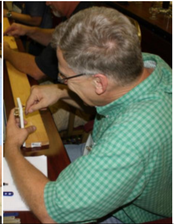
Although a couple of classes were cancelled due to lack of enrollment, the lock-picking class was packed with new-comers to expert locksmiths refining their skills.