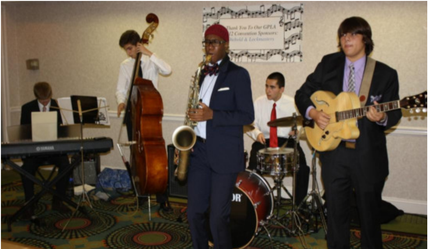
The Suburban Jazz Band, a collection of young high school artists from Bucks County, entertained the masses at the Big Band Bash social and the Awards Banquet.