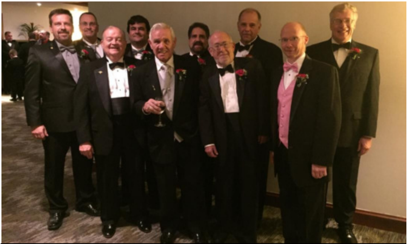
The Row Officers and Board of Directors