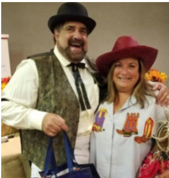
Friday Night Social -- Best dressed couple

(Editor's Note: Although our President is taking blame and is a true Mensch in every sense of the word, his tardiness in submitting the Presidential Viewpoint is not to blame for the late generation and distribution of the Newsletter. That ownership rests solely on the current Newsletter editor.)