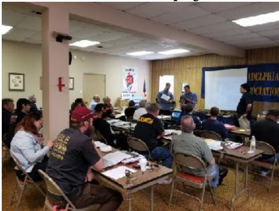
We had students in 6 other class rooms, this is the only picture I received..