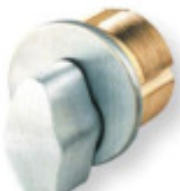
Solid Brass 1-1/8" Thumbturn 702-053 ___ 03 702-054 ___ 26D 702-055 ___ 10B