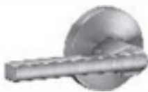
Falcon W lock

Falcon has the products you need at the price you want. Learn more about the product offerings at us.allegion.com .