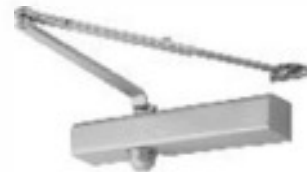
Falcon SC80A closer