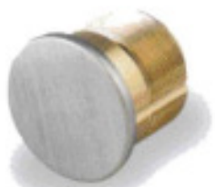
Solid Brass 1" Dummy 702-056 ___ 03 702-057 ___ 26D 702-058 ___ 10B