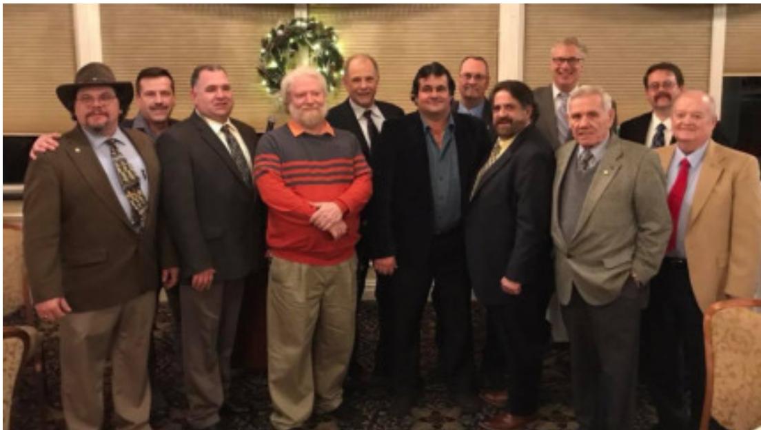
GPLA NEWLY ELECTED OFFICERS AND DIRECTORS