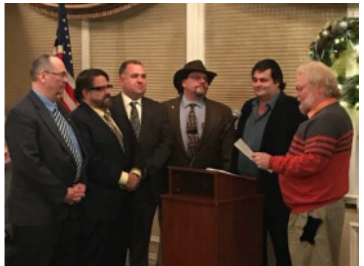
The Members of the Board